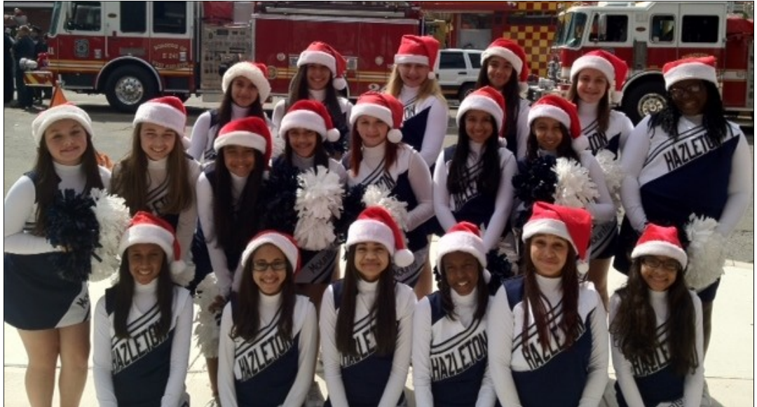
The 2012-2013 Hazleton Mounts cheerleading squad poses in West Hazleton before the Funfest Parade begins. The theme of the parade was Christmas in September .