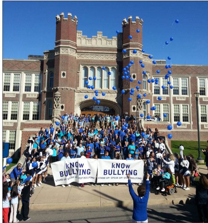
HEMS student representatives release blue balloons into the sky to symbolize letting go of bullying on October 1, 2012.

does not like to cover sad news, such as the recent tragic events. He wants to cover happy news. He ended by saying, "Bullies are cowards. They're just trying to show off!"