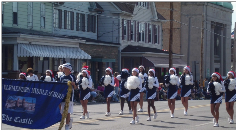
The Mounts cheerleaders march and cheer down Broad Street in West Hazleton during the Funfest Parade on September 9, 2012.